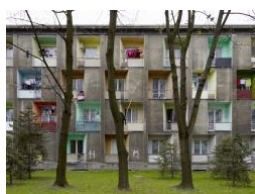
o.T. 1 (Nowa Huta), 2010–2011