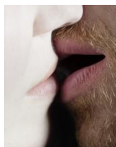
Cat Person, 2017

Venue: Fotografie Forum Frankfurt, Braubachstr. 30–32, 60311 Frankfurt