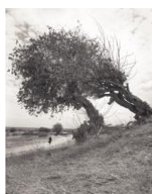
Separate, Together, Mundemu, Tanzania, 2017. From the series »From Where Loss Comes«, Platinum- palladium print from the original negative