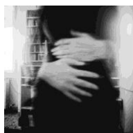
Self-portrait from the series »Diario Quotidiano«, 2008