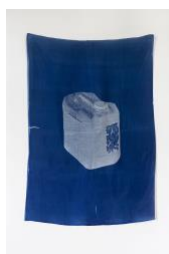
From the project »CORRESPONDENCE« (2021) © Martina della Valle

Please respect the copyright: All image material is to be used solely for editorial coverage of the FFF ACADEMY program 2022 at the Fotografie Forum Frankfurt. Please always mention the credit and copyright . Please note: 5 photos per medium can be used free of charge. Please send us two copies of your article to the address mentioned below.