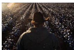
From the project »White Gold – Texas Blues«, 2007–2012