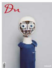
Cover Magazin »Du«, Issue 863 created by Ute Noll