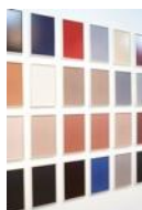
Ein ruhiger Tag. 73 Farbtafeln (1936-2009), 2016