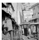
Lagos Island. From the series Lagos: All Roads, 2004

Opening Press Conference: Wednesday, June 02, 11 am (digital)