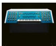
Das imaginäre Studio III, 2017