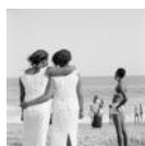
Victoria Island, Lagos. From the series Sea Never Dry, 2006