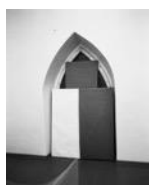
From the series Cults of performance, 2019