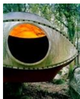
Lovag I, 2013. From the series Eurotopians

Opening Press Conference: Wednesday, June 02, 11 am (digital)