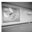
Berlin Wedding. From the series African Quarter, 2005