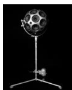
Das imaginäre Studio I, 2017