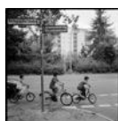
Berlin Wedding. From the series African Quarter, 2005