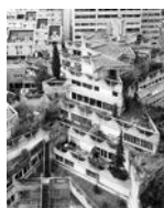
Gailhoustet/Renaudie V, 2016. From the series Eurotopians